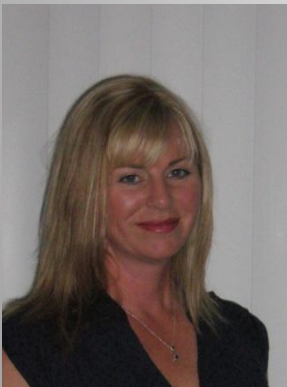
Women's Opportunity Award Honoree