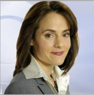
Ruby Award Honoree